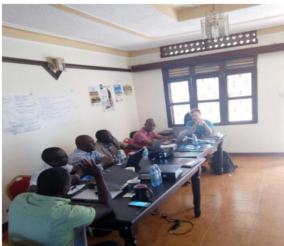
NASWU team lead by the president, 3 rd from right and team from CRS lead by Program manager 4Children 1 st from right